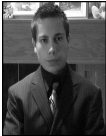
LDF/Wendy's Dave Thomas Hispanic Legacy

2011 Wichita Hispanic Chamber of Commerce and Kansas Hispanic Education & Development Foundation scholarship recipient